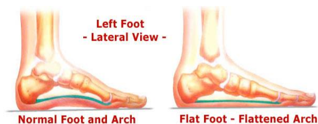
Illustration showing normal and full arched feet

Most adults with flexible flat feet have strong, pain free feet.