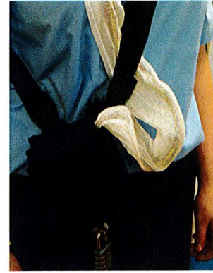
Photograph of a recorder placed in bag

Whilst being monitored, your child will be able to attend school or nursery as normal but will not be able to take part in sports or swimming class whilst the electrodes are in place.