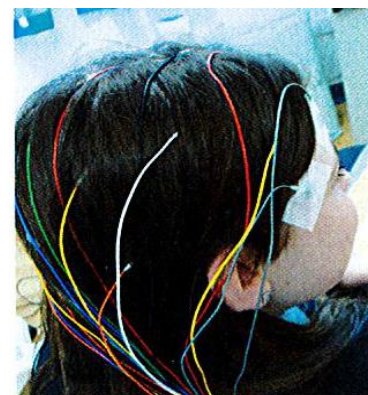
Photograph of electrodes attached to patients scalp

For the test please ensure your child has clean hair which is free from hair gel etc.