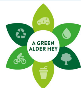
Reducing our carbon footprint one step at a time

Read about Alder Hey's performance during 2021/22 in our Annual Report and Accounts.