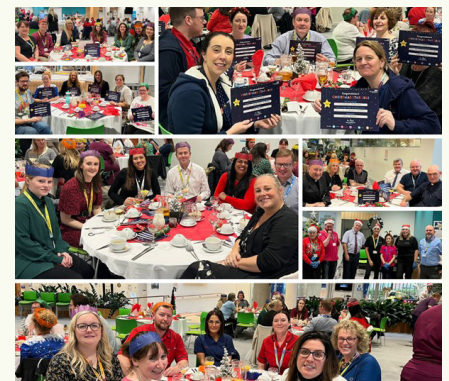
Our Christmas stars staff lunch!

We also welcomed our friends at Rapid Relief Team who gave out free cake and hot drinks to those on our main Hospital site.