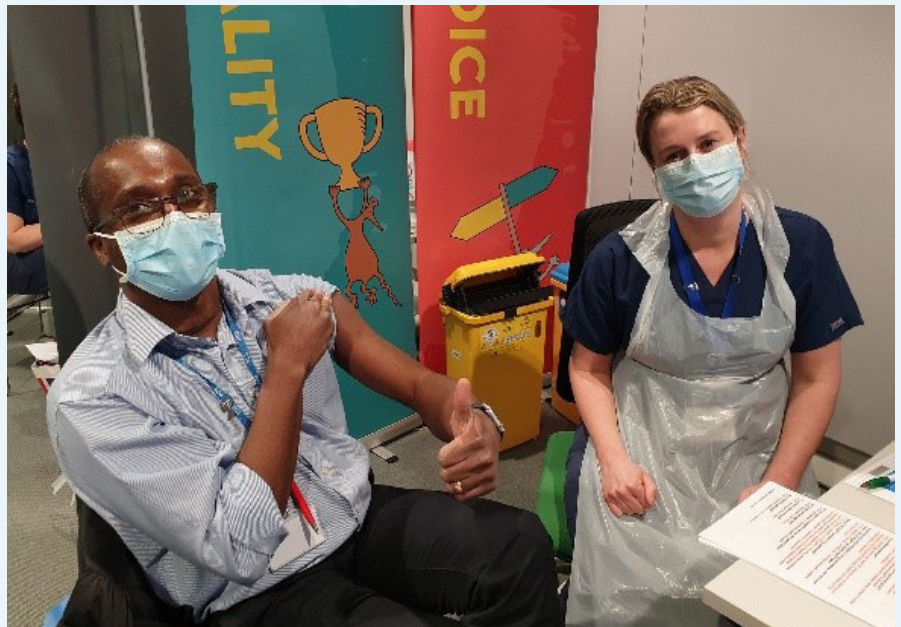
(Above) Keeping staff and patients safe with both our COVID and flu jabs